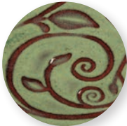
O-42 Moss Green