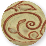
O-30 Autumn Leaf