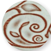
O-10 Transparent Pearl