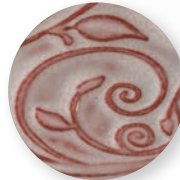
O-54 Dusty Rose