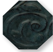
O-2 Black Tulip