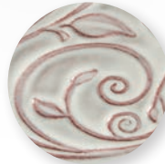
O-11 White Clover