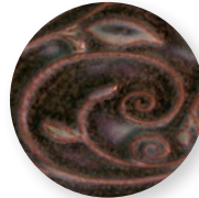
O-57 Mottled Burgundy